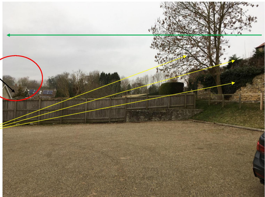
Fig 2. From village hall car park – shows roofs of neighbouring buildings

Overlooking from proposed development - no impact